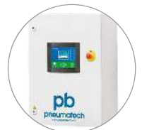
NEMA 4 electrical enclosure