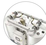
Reverse in and outlet pipe