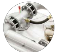
Purge nozzle optimization