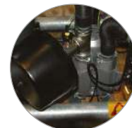
Inlet blower filters